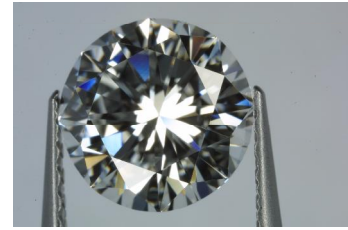
Photo of Stone

Shape and Cut Round Brilliant Cut Measurements 6.68 - 6.74 x 4.04mm Weight 1.12ct. Clarity VVS-2 Color F Cut Good